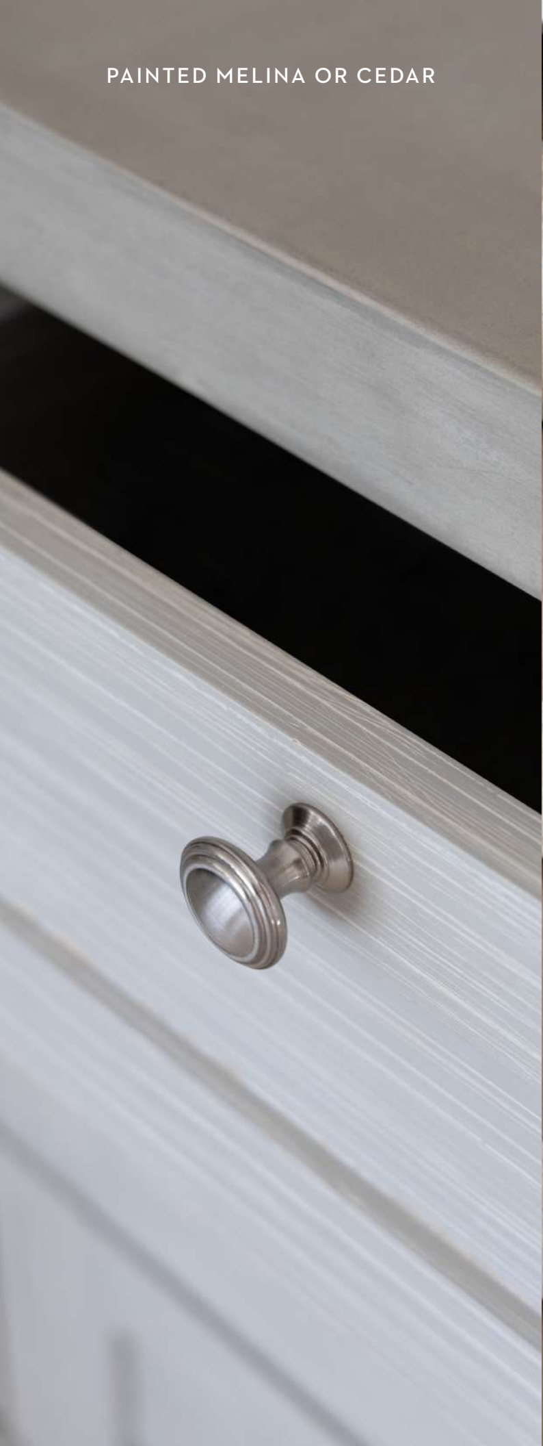
PAINTED MELINA OR CEDAR