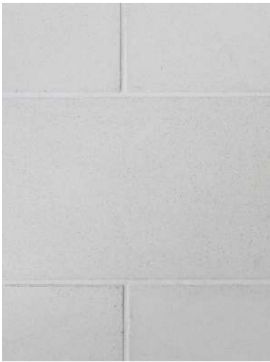
BALDOSA TILE REGULAR