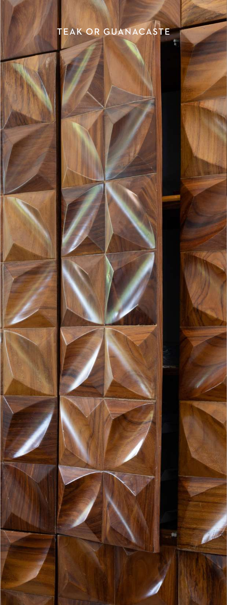
TEAK OR GUANACASTE