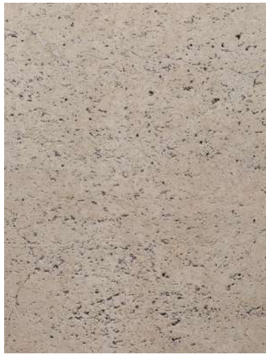
BALDOSA TILE TEXTURED